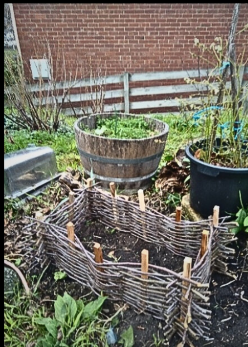
My garden handiwork

A very long time ago I was travelling in an old post office van in Central Australia. Reading my journal from that journey recently, I found this comment from one day - 'You can't have too many plastic bags!' Turns out you can! Plastics have become a huge problem as you know. I've just completed the survey that the Tasmanian Department of Natural Resources and Environment has launched to canvas our concerns about and support for phasing out of single use plastics. You can complete it here: http://www.nre.tas.gov.au/plastics-consultation .