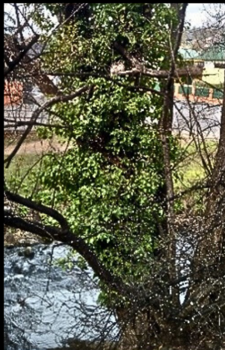
Zoom in to the centre for the birds

still a lot of restoration work happening, often with the collaboration of local schools and residents, and it is a delight to see the re-assimilation of nature into the urban environment. In my garden I'm getting the beds ready for spring plantings and I'm ridiculously proud of the new raised bed I made out of apple tree prunings. I plan for it to be the basil plot. These are all really supportive and restorative activities for me.